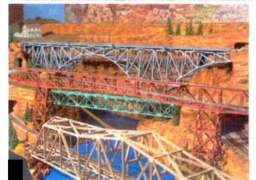
Come to Winterfest 2004 and see it in person.