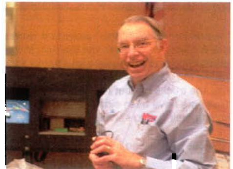
Below are some pictures of close-up pictures of Bob's new module showing the many bridges.