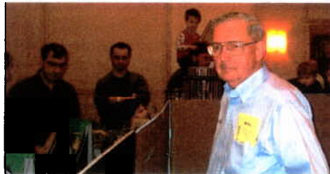
These are some of the comments and questions I heard at the National Heritage Museum on Dec. 27th.

"Oh, everything is so nicely done, it just brought tears to my eyes....Are these sections parts of home layouts?....Do you have a permanent place to set up and run trains?....I just love that carnival; I remember all those rides from long ago....Did he really make all those (motor) cars himself?....Why are all the coal (hopper) cars empty, but not the last one?....All those bridges and all the trains running on them - that's really great.... I counted twenty-four cars on that train and when it came back there were twenty-five!?!?...We got a train set for Christmas, but we can't get the engine to run....Lookit - here comes another train!....Can you tell me some good hobby shops? ...I am thinking of starting another layout....My young ones spend hours with the Brio trains....I am coming back tomorrow with my wife."