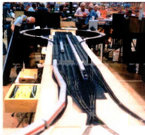
Long Island HO HOtrack Club. Note interior for 8 track staging yard with outer tracks forming loop for continuous mainline running.

The first surprise was included in the Long Island NTrak layout, which itself was extensive: a large square with two peninsulas each with a loop track at their ends. The surprise was a brand new, experimental, hinged lift bridge, which I understand is a Bob Gatland project. This was the first time the bridge was being used under train show conditions. Compared with the heavy-duty bridge we have used at several Winterfests, this is a lightweight, innovative, attractively designed structure. It seemed to perform perfectly both during the lift for passage of humans and the re-latch for smooth running of trains. This is a promising development and I hope that further testing will prove its value for NTrak.